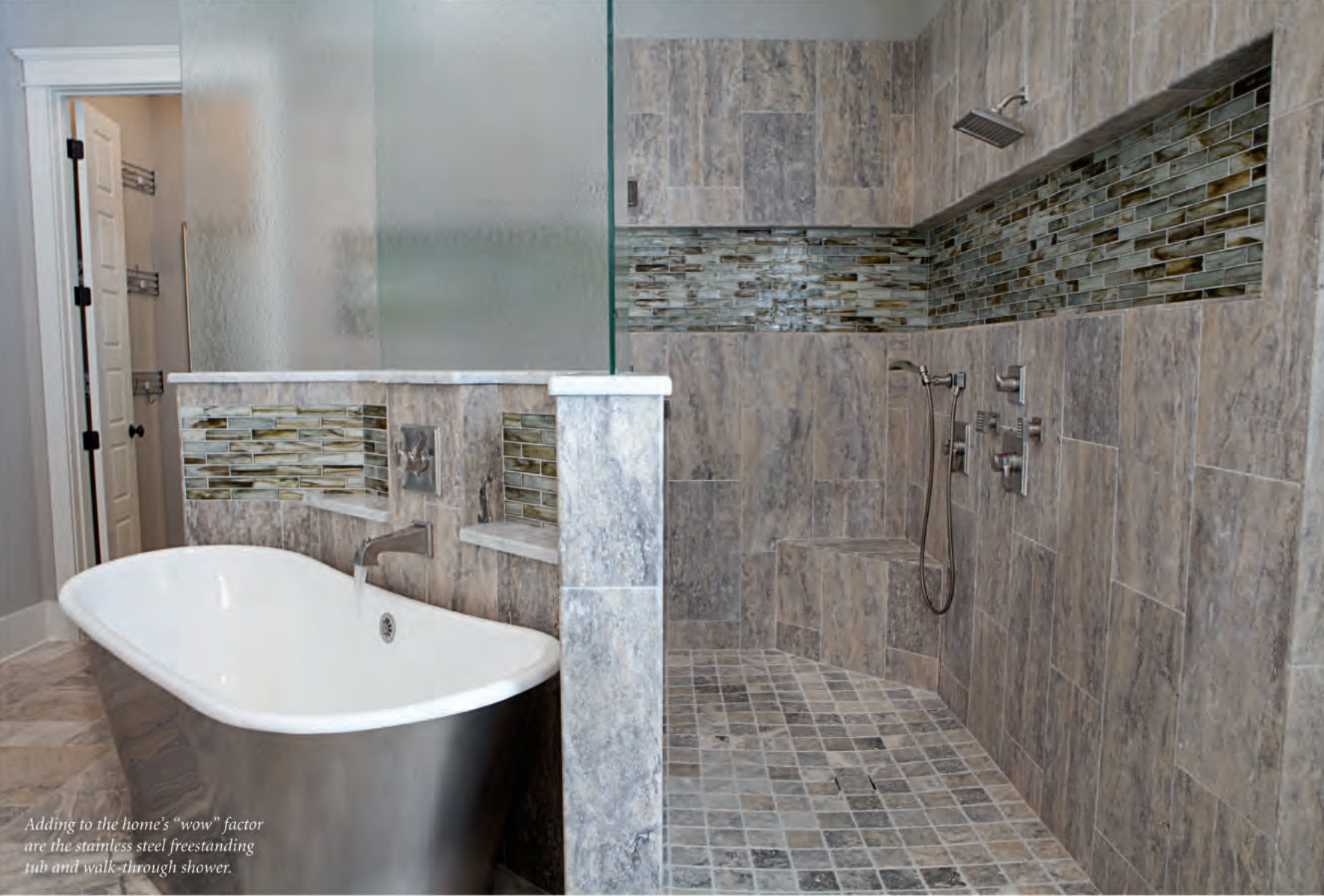
Adding to the home's "wow" factor are the stainless steel freestanding tub and walk-through shower.