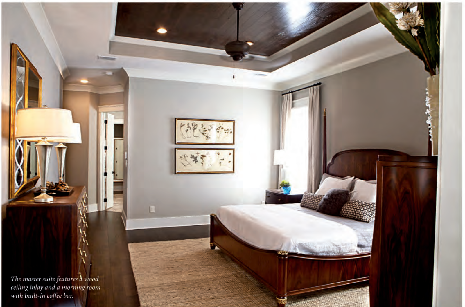
The master suite features a wood ceiling inlay and a morning room with built-in coffee bar.

Other focal points of the home include a portecochere and auto court, a bonus room above the garage that can be used for a variety of purposes from “man cave” to home office, and a media room with an 80-inch screen, terraced seating and surround sound.