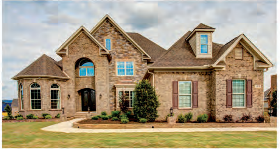
This year's H/MCBA Showcase Home was built by Woodland Homes.

As an added incentive to buy now, BancorpSouth Mortgage provided a $5,000 giveaway towards the purchase of a new home for one lucky consumer.