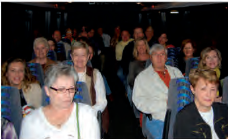
A bus full of members gets ready to head to nearby Ocean Springs for an afternoon of shopping and exploring.