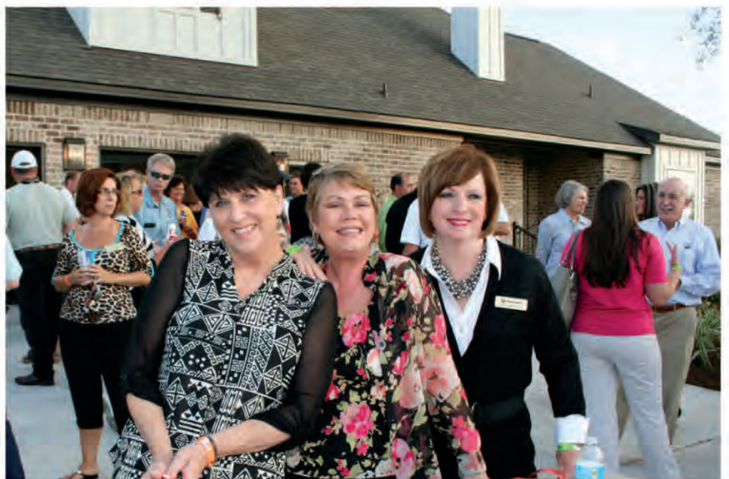
More than 240 members of the HBAMM turned out for its Parade of Homes street party.

The public was allowed to tour the Showcase Home in exchange for a donation, which was given to the Child Advocacy Center. The home sold during the Parade.