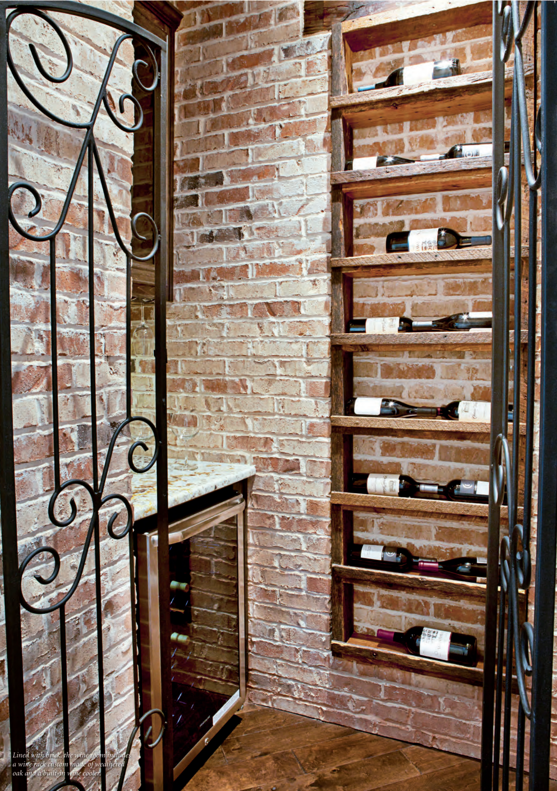
Lined with brick, the wine room includes a wine rack custom made of weathered oak and a built-in wine cooler.