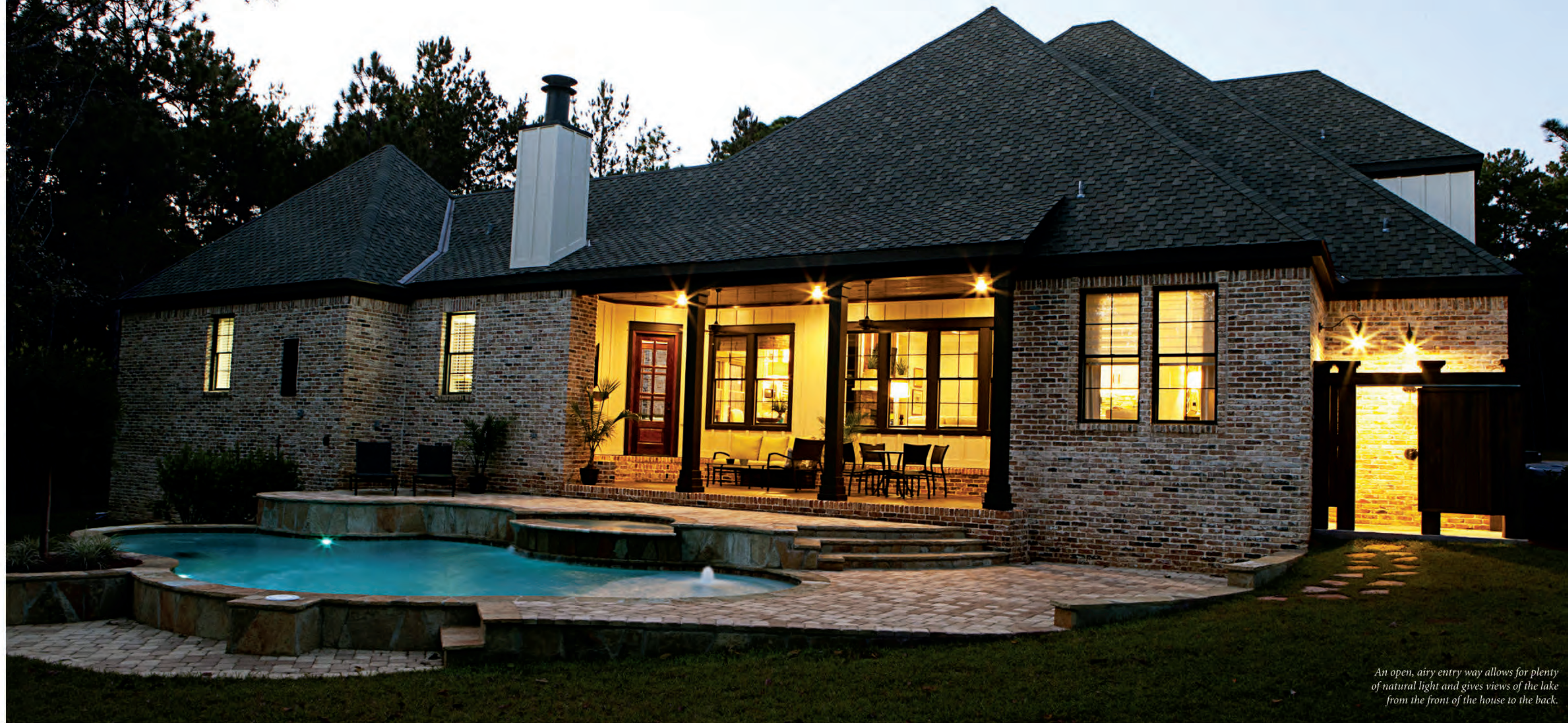
An open, airy entry way allows for plenty of natural light and gives views of the lake from the front of the house to the back.

SHOWCASE STUNNER BUILT BY TRULAND HOMES, LLC