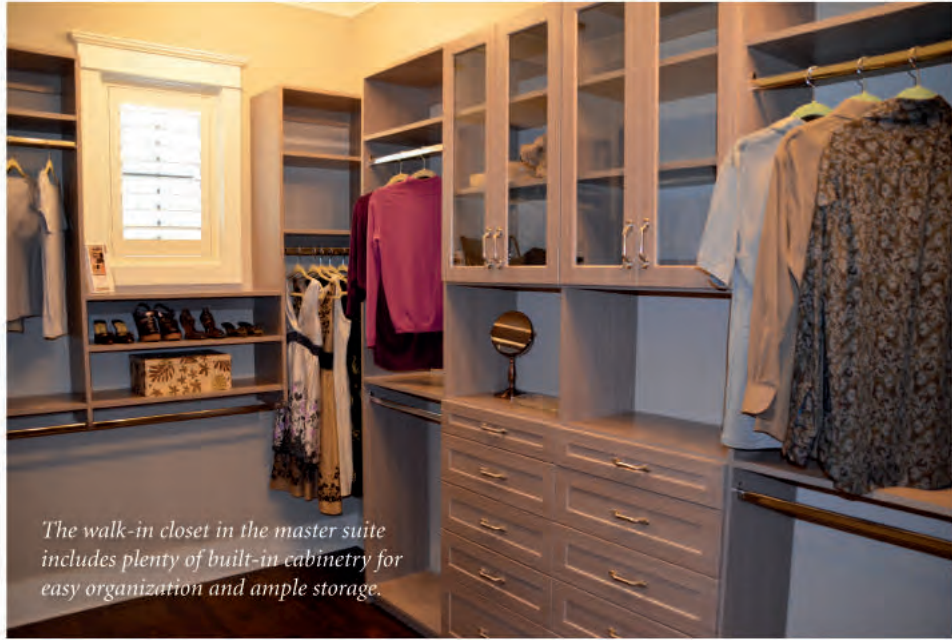
The walk-in closet in the master suite includes plenty of built-in cabinetry for easy organization and ample storage.

According to BCHBA Executive Vice President Fran Druse, between 3,500 and 4,000