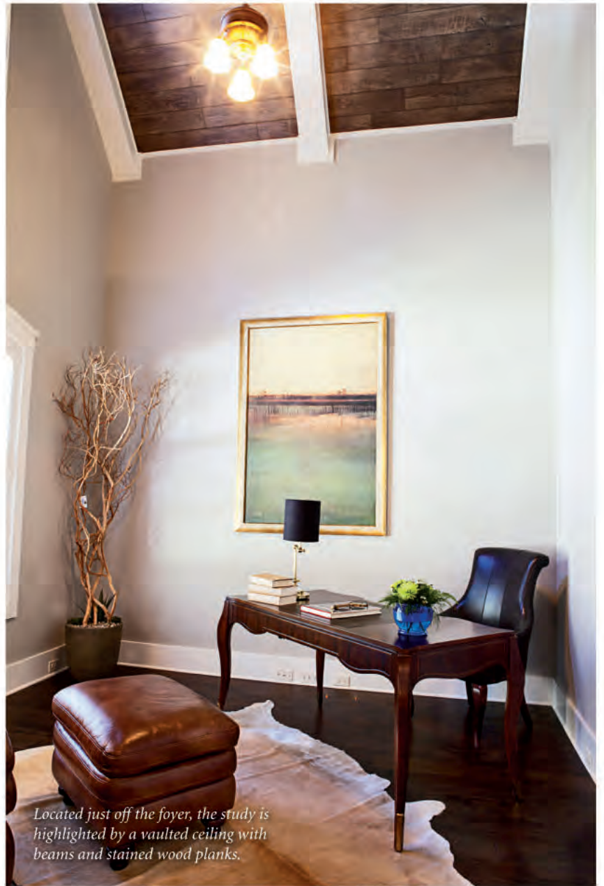
Located just off the foyer, the study is highlighted by a vaulted ceiling with beams and stained wood planks.

Truland Homes was founded in 2011 and has been a member of the Baldwin County Home Builders Association since its inception. They build custom homes on a pre-sale and spec basis, with 120 homes constructed in 2013.