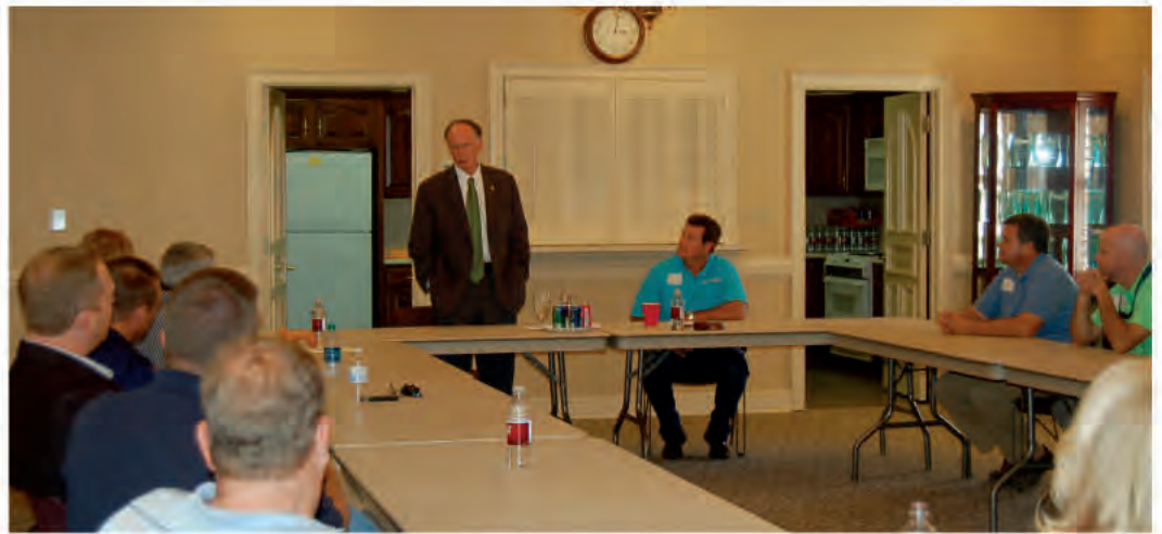
Governor Robert Bentley addresses issues affecting the home building industry in a recent meeting at the H/MCBA office.

Lasting well over an hour, the meeting presented the chance to interact one-on-one with the Governor as he answered questions on roads, the state economy, health insurance issues, and many other issues facing the building industry.