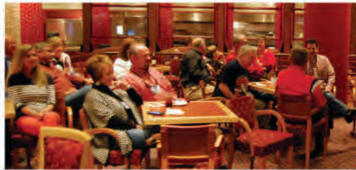
Football fans turn out to watch Auburn take on Tennessee and Alabama battle LSU during the HBAA's tailgate party.