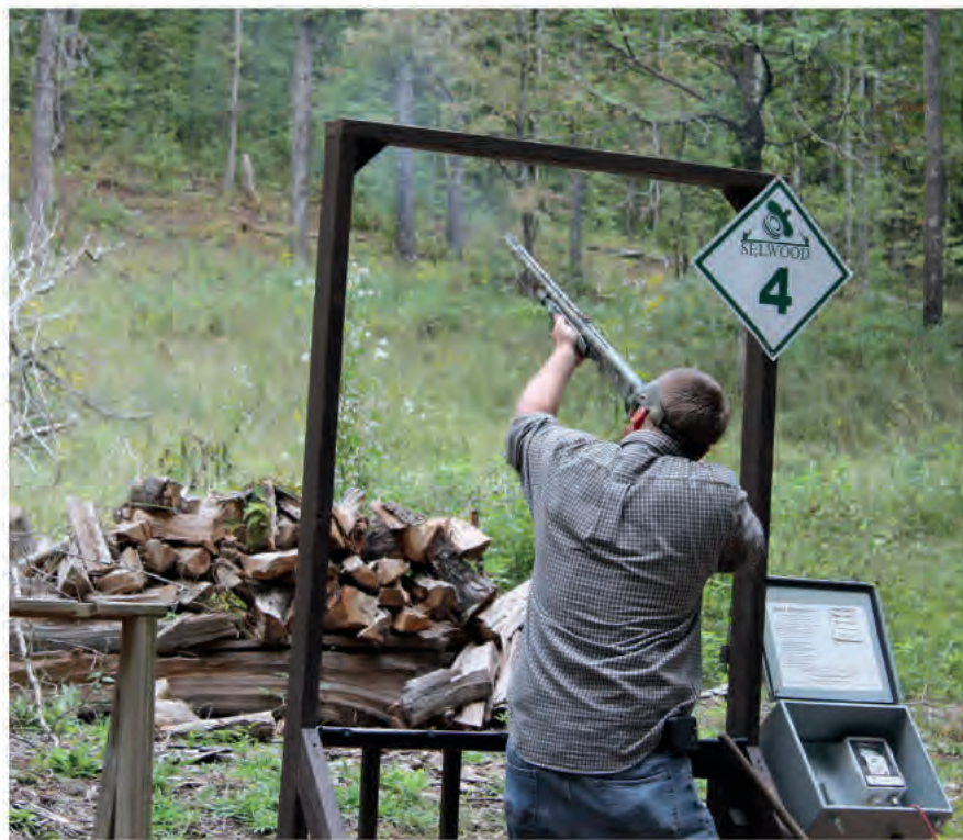
GBAHB South Chapter members test their shooting skills at the chapter's recent skeet shoot at Sellwood Farm.