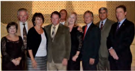
Members of the Baldwin County HBA enjoy the awards banquet at the Annual Convention.