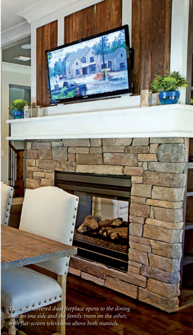
The stone-covered dual fireplace opens to the dining area on one side and the family room on the other, with flat-screen televisions above both mantels.

visitors with its free-standing stainless steel soaking tub surrounded by a wall of semi-transparent rain glass. Behind the wall is a dual-entry, 10-foot long linear walk-through shower with ten shower heads.