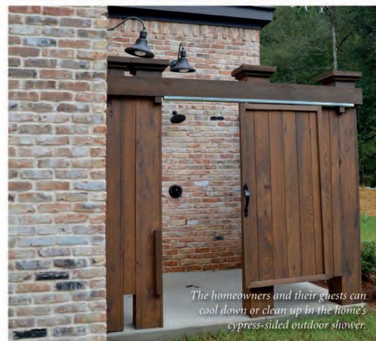
The homeowners and their guests can cool down or clean up in the home's cypress-sided outdoor shower.

C ombining Old World charm and the latest design elements, this Showcase Home, built by Truland Homes, LLC was the centerpiece of the Baldwin County Home Builders Association's 2013 Parade of Homes. Read more about the home beginning on page 18.