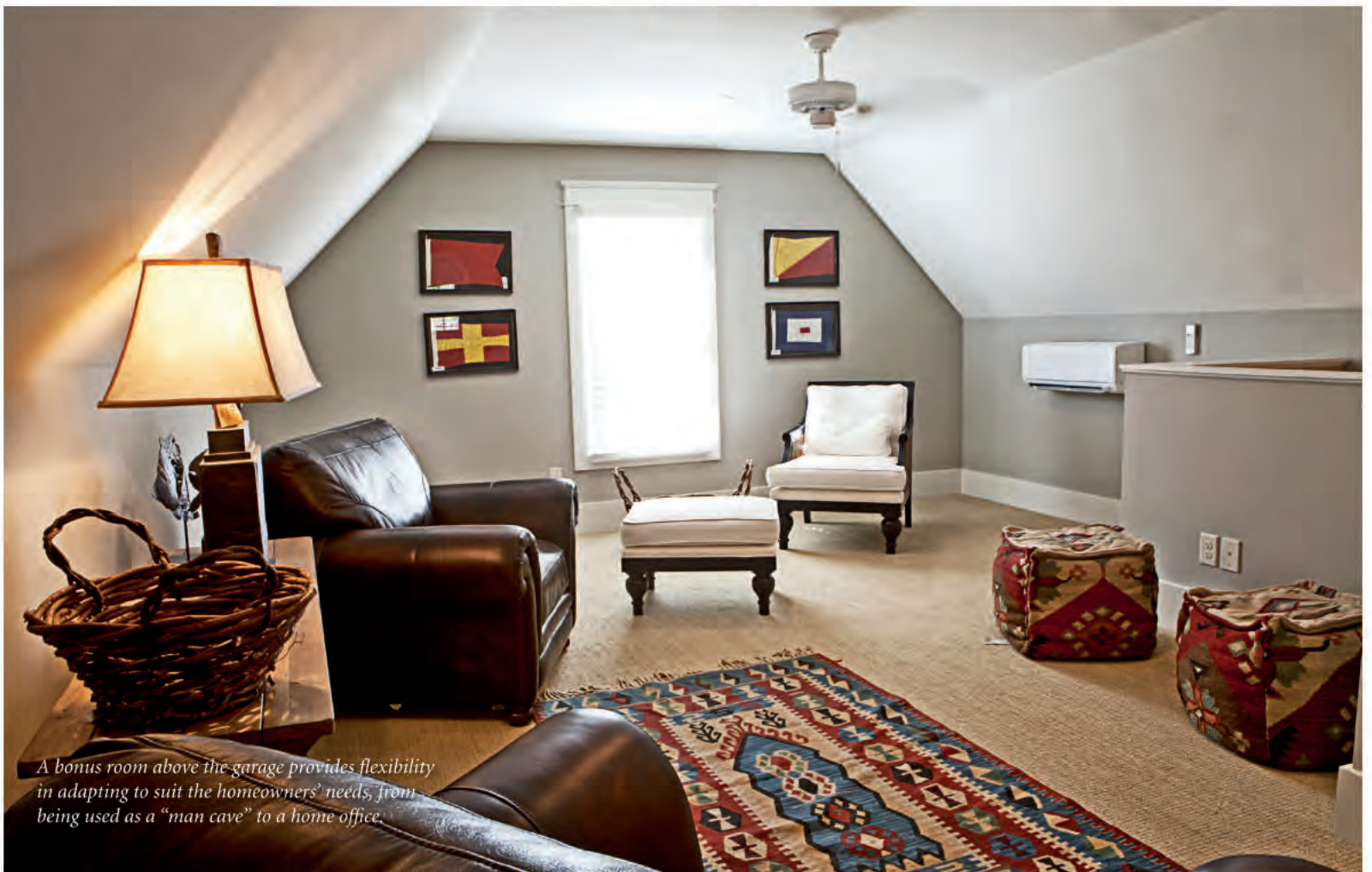
A bonus room above the garage provides flexibility in adapting to suit the homeowners' needs, from being used as a "man cave" to a home office.