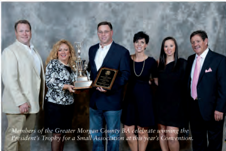
Members of the Greater Morgan County BA celebrate winning the President's Trophy for a Small Association at this year's Convention.

Several individual members were honored for their outstanding service at both the local and state associations, their community and the building industry as a whole in 2013.