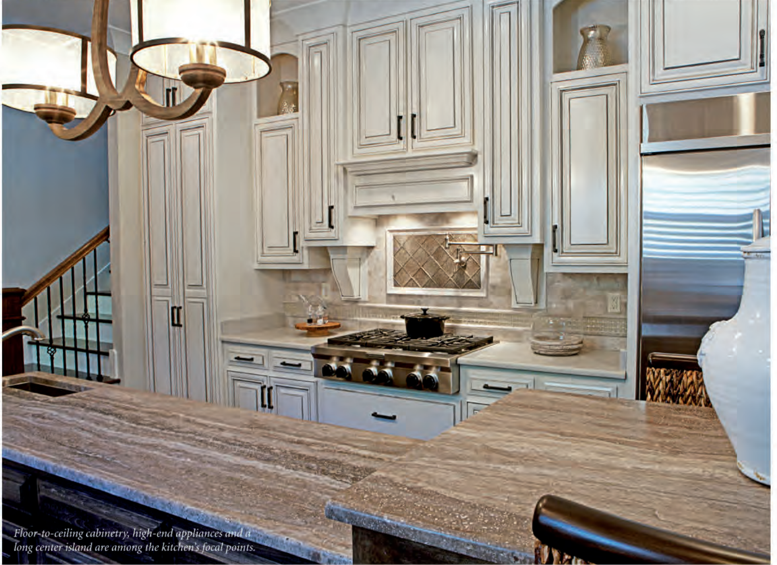
Floor-to-ceiling cabinetry, high-end appliances and a long center island are among the kitchen's focal points.