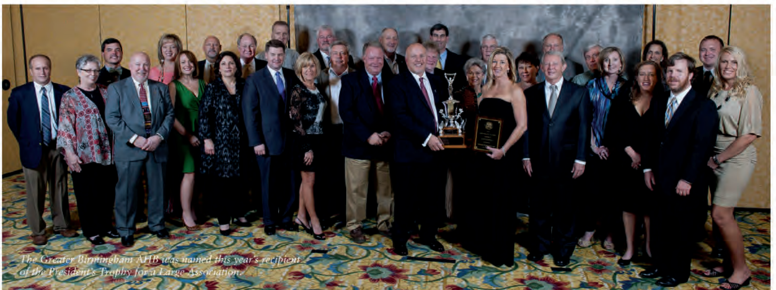
The Greater Birmingham AHB was named this year's recipient of the President's Trophy for a Large Association.