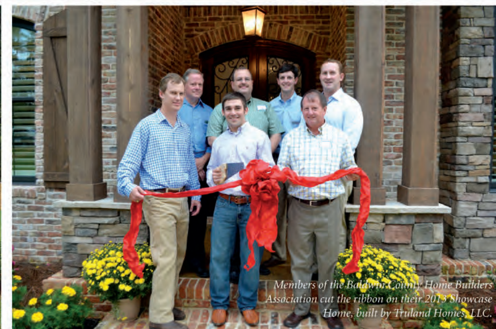
Members of the Baldwin County Home Builders Association cut the ribbon on their 2013 Showcase Home, built by Truland Homes, LLC.