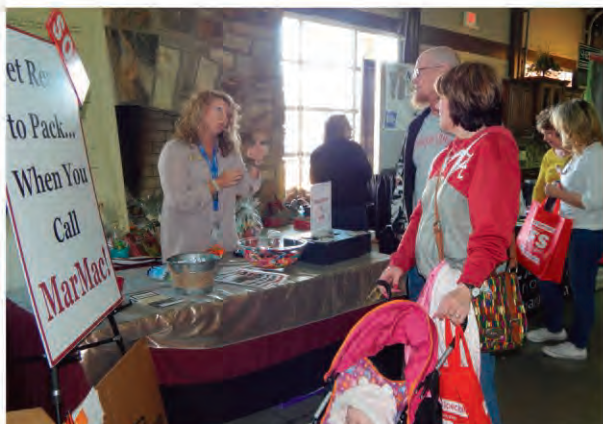
Over 1,500 consumers turned out for the GMCBA's 2016 Home and Garden Show, its most successful show to date.