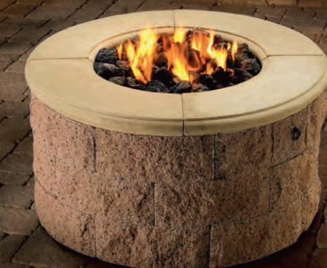
Outdoor fire pit by Mason-Lite