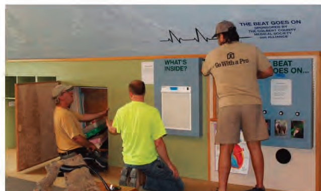
Members of the Shoals HBA work on renovating the Children's Museum of the Shoals.

The SHBA Board voted to donate $1,000 for materials and to match financial donations from individual members up to another $1,000. Altogether, SHBA members and member companies donated more than $30,000 in labor and materials to the project.