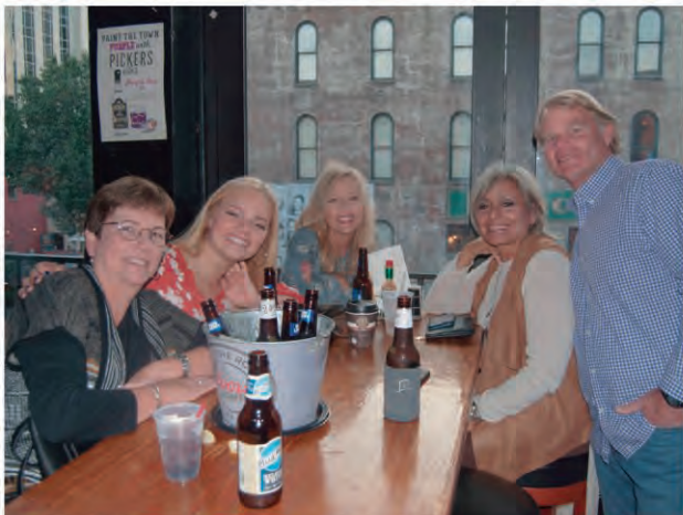
Members of the Lee County HBA enjoy food and live music at the Welcome Reception at Honky Tonk Central.