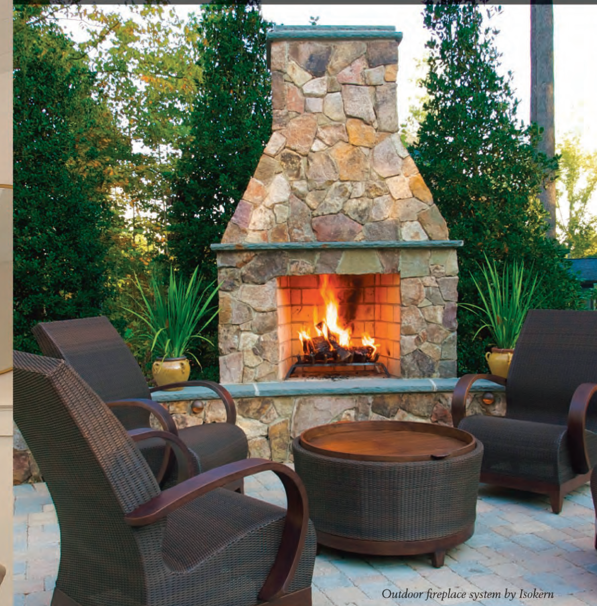
Outdoor fireplace system by Isokern