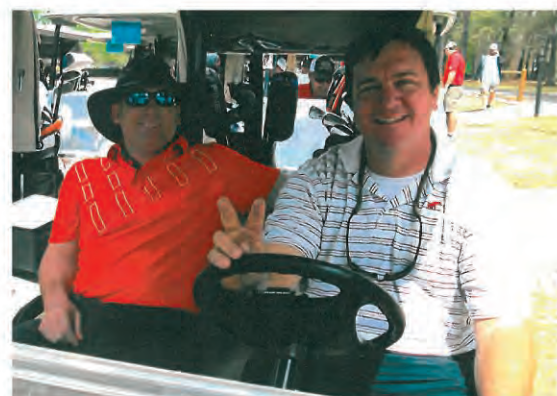
Not only did HBA of Dothan & the Wiregrass Area enjoy a fun day of golf but they also helped the association surpass its ABPAC goal in the process.

The tournament featured a mix of builder and associate members. The day concluded with a cookout with door prizes and prizes awarded to the tournament winners. Thanks to the efforts of the volunteers and participation by the members and sponsors, the association surpassed its ABPAC goal for the year and made a good event even better.