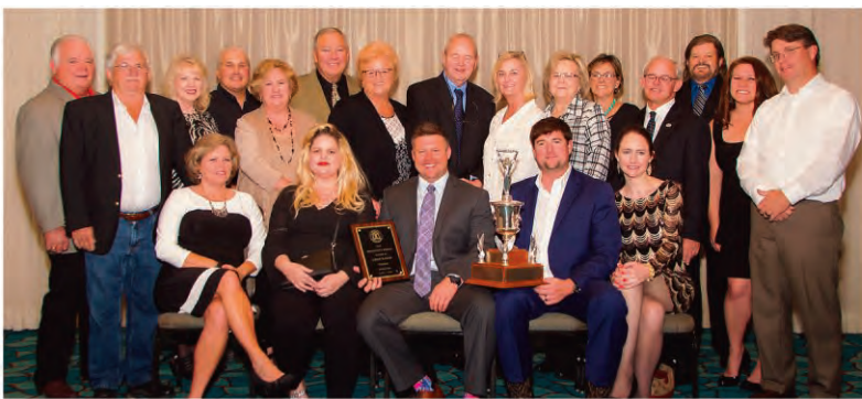
Members of the Shoals HBA celebrate their third year in a row of winning the President's Trophy for a Small Association at this year's Convention.