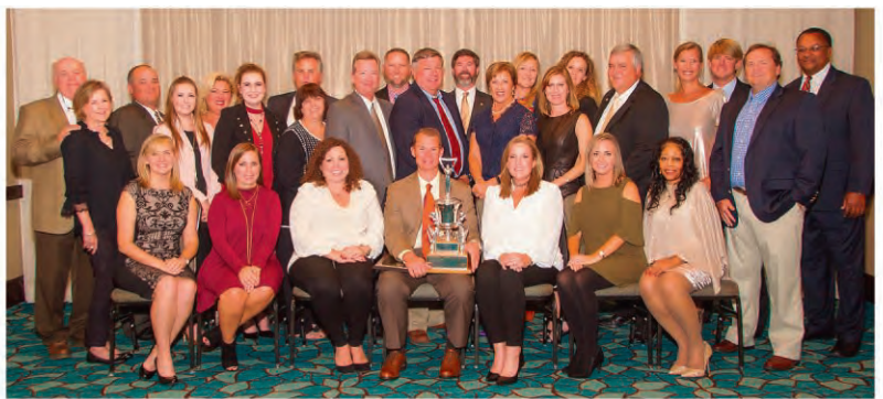
The Greater Montgomery HBA repeated as the winner of the President's Trophy for a Large Association.