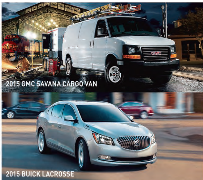
2015 GMC SAVANA CARGO VAN