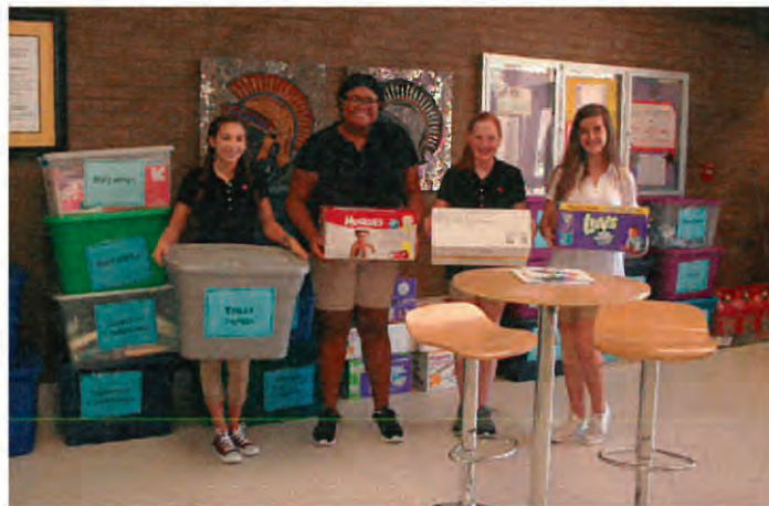
The HBAMM partnered with students at Daphne Middle School to collect supplies to send to flood victims in Louisiana.

A utility van and car were packed full of supplies and taken to the Capital Region Builders Association office in Louisiana. Their members who had suffered damage or lost their homes were able to come in and "shop" for items needed. They also received Walmart gift cards, which had been purchased with the money collected. The donations were greatly appreciated by the Capital Region members and gave the HBAMM a way to "pay it forward" in response to the help they'd received in times past.