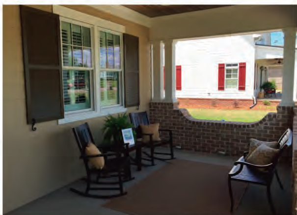
The HBA's 2016 Showcase Home sold while it was still under construction.