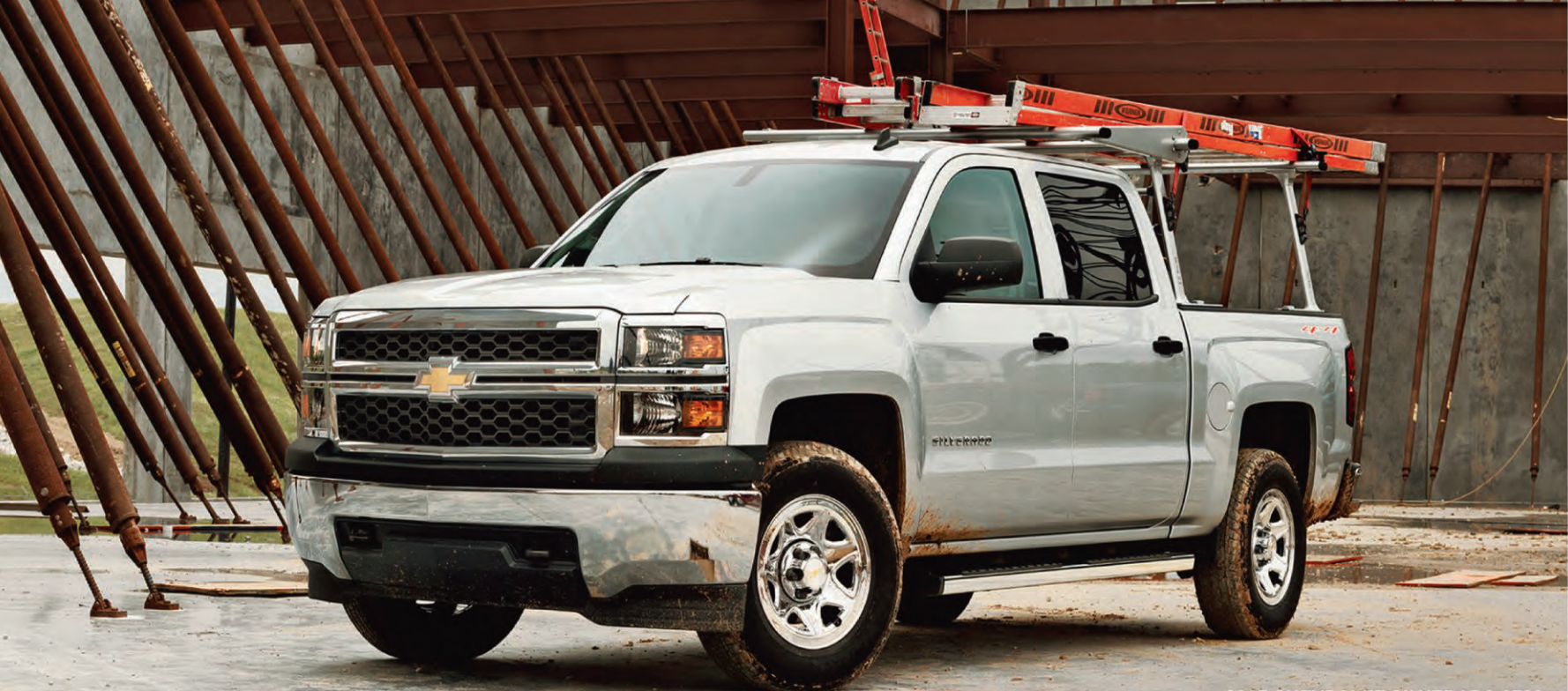
2015 CHEVROLET SILVERADO 1500