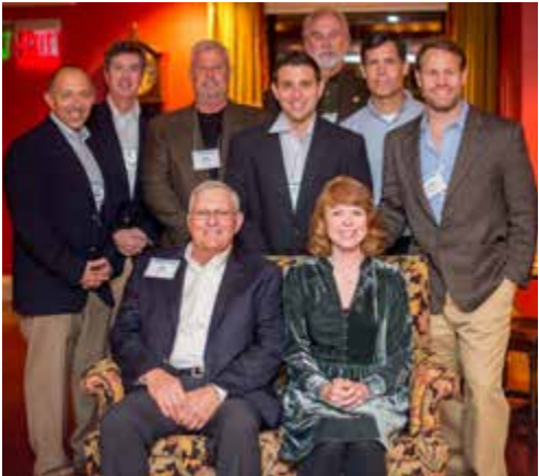
Members of the HBA of Dothan & the Wiregrass Area gather together at the Legislative Reception.