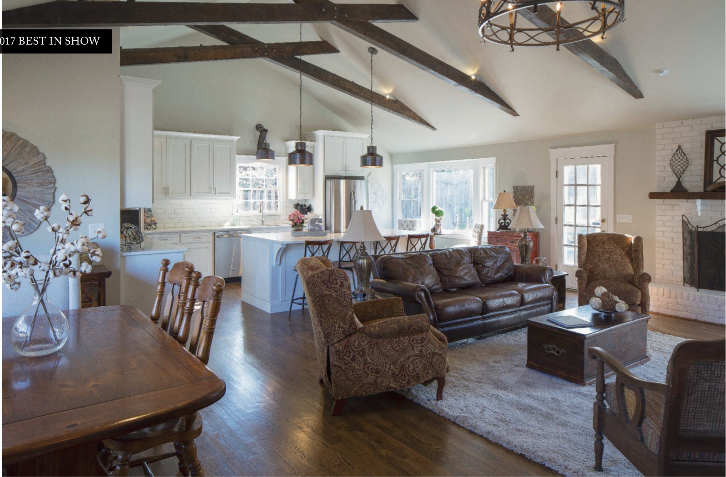
HOUSE OF TREES TAYLOR BURTON COMPANY, INC. WINNER | SPACE RENOVATION

T his family of four was in love with the convenient location of their home but they were not in love with the avocado appliances, outdated carpet and dysfunctional layout. The room sizes were small and they did not have a need or want for a formal living room. A plan was created to remove all the walls in the foyer, kitchen, dining, den and living room to create one large room that can share space. The 8-foot ceilings were raised, exponentially increasing the feel of the space. Five giant, overbearing trees in the small backyard were harvested and repurposed as scissor trusses to support the roof. The lumber was also used to create new stair treads, kneewall cap and a window seat in the new