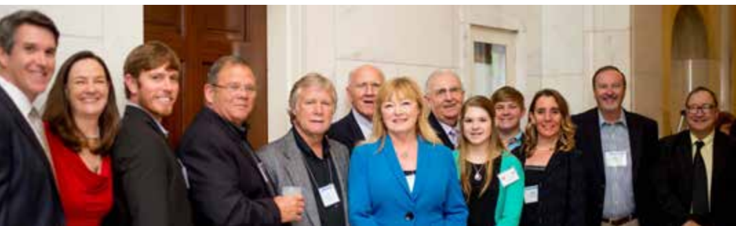
Baldwin County HBA members enjoyed visiting with their legislators during the Legislative Reception.