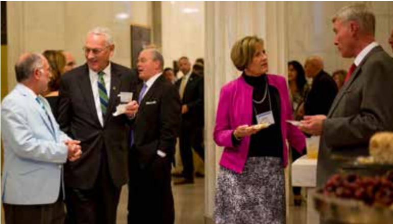
The HBAA's annual Legislative Reception, held at the Alabama Department of Archives & History, gave members a valuable chance to connect face-to-face with their legislators and other government officials.