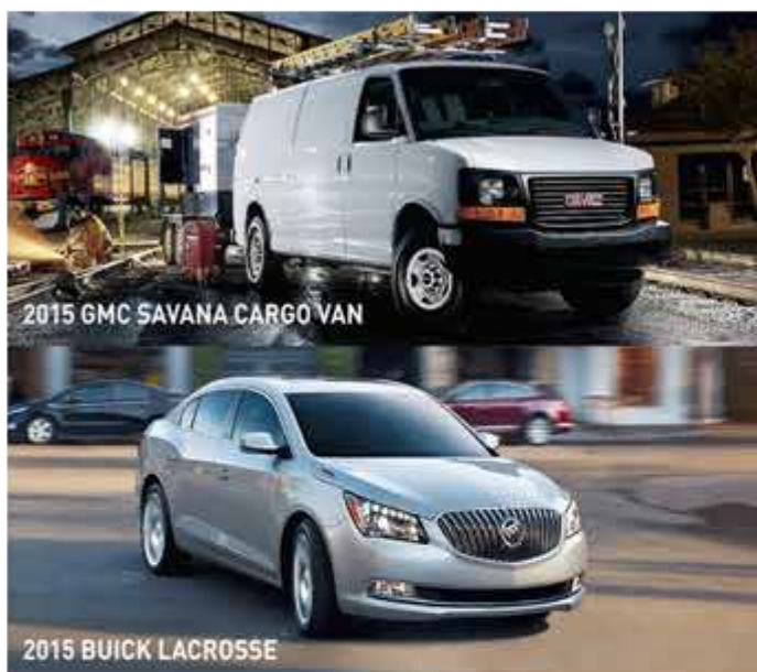
2015 GMC SAVANA CARGO VAN