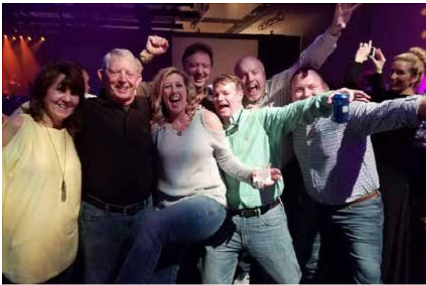
Members of the Greater Birmingham AHB enjoy the Spike Party at the 2017 International Builders Show in Orlando.