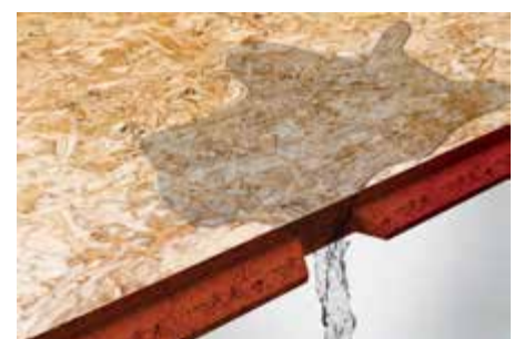
LP® TopNotch® RainChannel™ Notch System