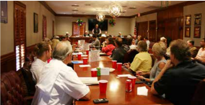
HBAMM members gather for breakfast and to hear about plans for the 2017 Parade of Homes.

The Home Builders Association of Metro Mobile recently hosted a Parade of Homes breakfast at its office. Associate members were able to submit incentives to builders who are interested in entering homes in the 2017 HBAMM Parade of Homes. The board room was filled with attendees eager to make plans for the Parade.