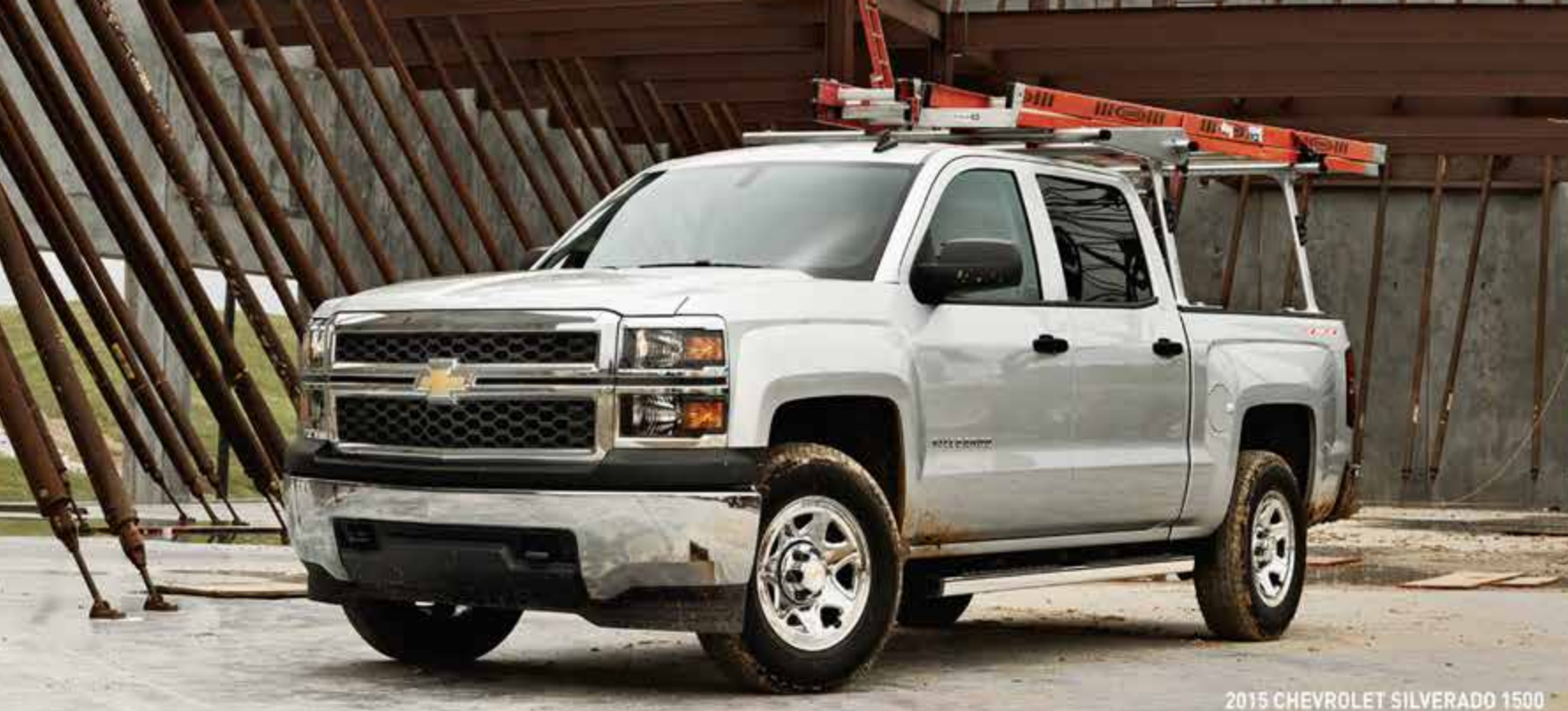
2015 CHEVROLET SILVERADO 1500